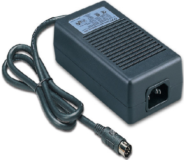
Dimension : L132×W69×H40mm ( L 5.20" x W 2.72" x H 1.57" ) AC Input : IEC 320-C14 Inlet